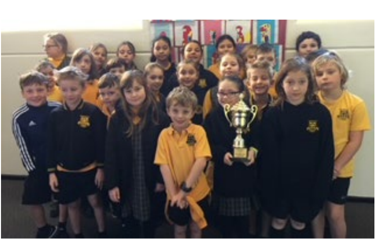
Congratulations to the Rosellas, who received the Principals Award for Excellence Trophy in last weeks assembly They are creating fabulous artworks in visual art.

Semester 1 reports are due in the last week of term. This year we are trialling online reports. All parents will be able to access and download their child/children's reports. You will also be able to access previous years reports, so when you've lost one and can't find it you'll be able to access it! This is such a good environmental. For those of you with children completing Naplan, we will also add access to these documents so when the paper copy ACARA sends to parents goes missing you will also be able to download that. Details of the process for this will be on Skoolbag once they are available. We will be saving so much paper and many trees as a result of this green initiative!