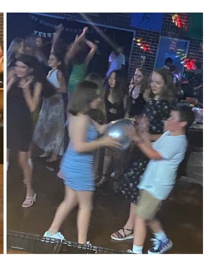
The Year 6 Graduation and formal was a fabulous event The students all looked sensational and enjoyed a dinner followed by dancing.

Thank you to the staff for all their work setting up and decorating and the P&C for sponsoring the event (paying the bills!).