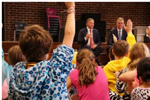
Photo: Federal MP Anthony Albanese and Parliamentary Speaker Tony Smith face tough questioning from students.