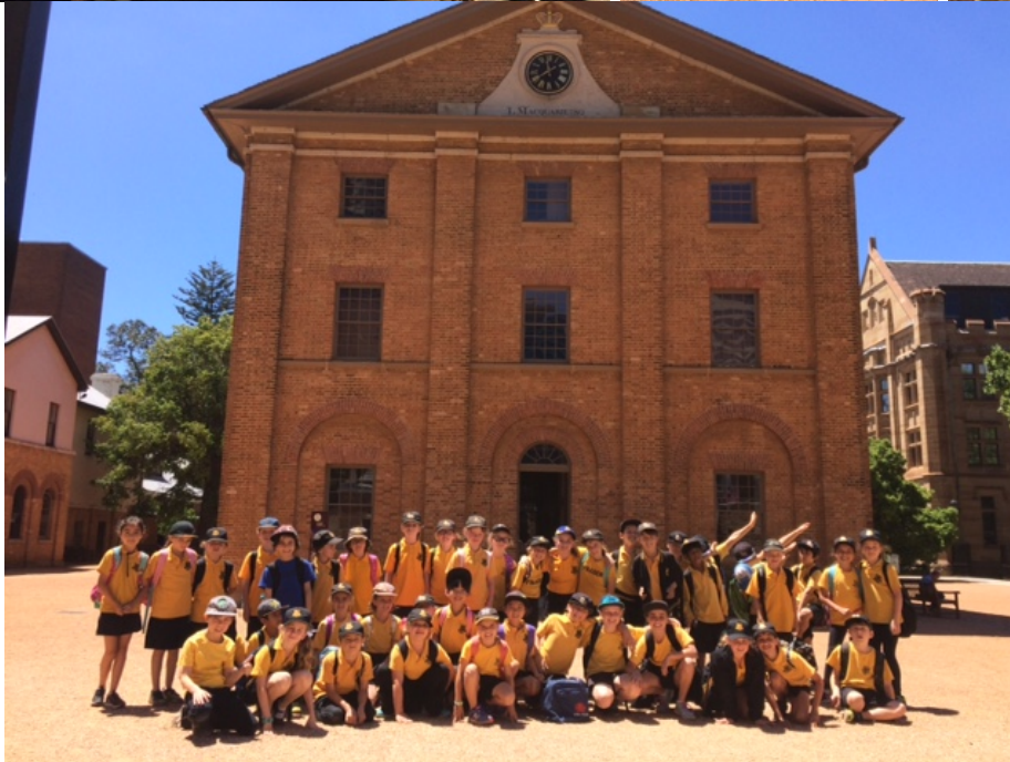
Stage 2 Excursion Museum of Sydney & Hyde Park Barracks