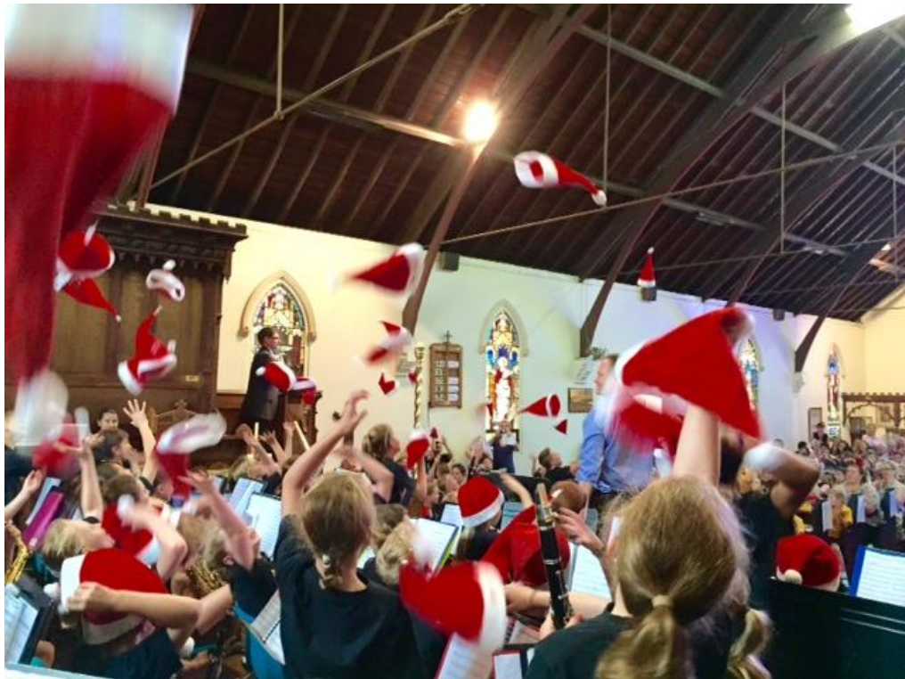
Students throw their hats in the air at the end of the concert