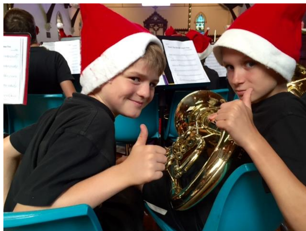
A big thumbs up for the Birchgrove Music Program

Finally, hope you all have a safe and happy holiday!