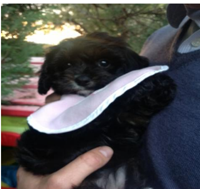
1st Place - Pepsi (Dylan Procter 3/4C)

Many thanks to all who entered in support of raising funds towards our Big Night Out. Congratulations to all the extremely cute place getters.