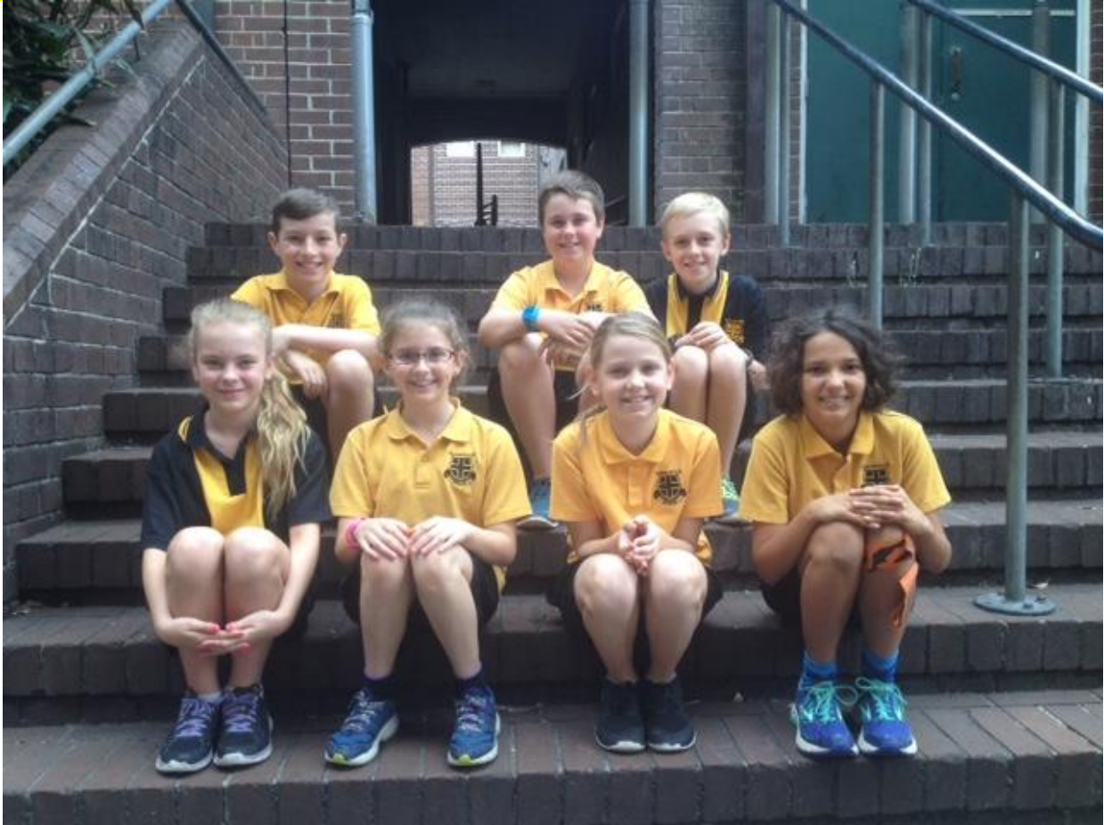
Congratulations to our newly elected 2015 Student Parliament Ministry!