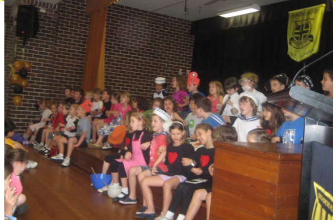
Year 1 Performance