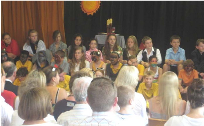
Year 6 stole the show with their trip down memory lane!